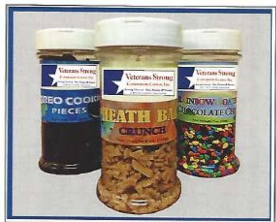
Spice Bottles are 6" High x 2.7" Diameter(soda can size)